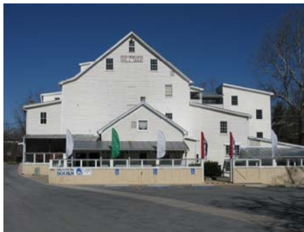
Edinburg Mill Museum