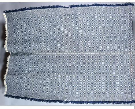
Textiles from the Museum of the Shenandoah Valley

While the Shenandoah Valley is known for its strong quilting tradition, quilts are only one facet of the tapestry of textiles produced and used in the region. Samplers and needlework pictures, sumptuously decorated whitework, homespun blankets in vibrant colors, and even firebags emblazoned with owners' names transformed Shenandoah Valley houses into homes.