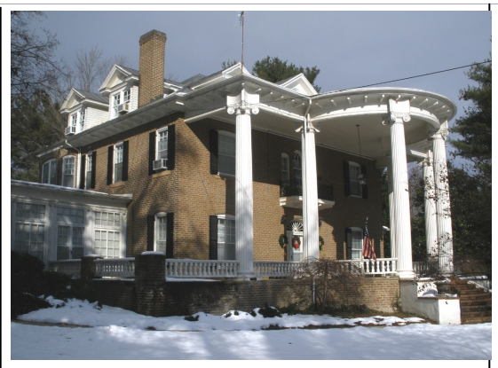
225 N. Muhlenberg Street

The house was built in the Colonial Revival style of architecture which was popular in the early part of the 20th century. However, this house is earlier than many local examples of the Colonial Revival style suggesting that Clyde and Maude were architectural trend setters of their day in Woodstock. Inside, there is a very large entrance foyer that leads to the graceful central staircase. The parlors on either side of the entryway are only divided from the entrance by interior columns. The left hand parlor leads to a spacious dining room with a very large opening