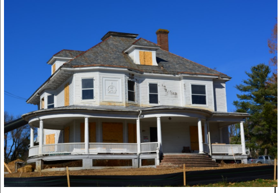
Recently purchased house next door

between the rooms which can be closed off with oversized pocket doors. The openness between the entry hall, the two parlors and the dining room creates a sense of great space which is further enhanced by the very large size of the house. The galley kitchen in the center rear of the house is surprisingly small, but perhaps seemed large enough 100 years ago.